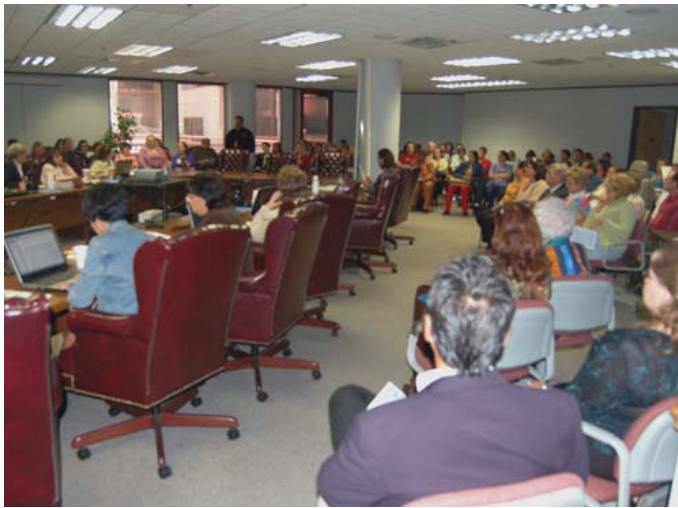
The BNE Public Hearing on Nursing Work Hours was attended by more than 75 people

correlates increased work hours with increased incidence of nursing errors. The Institute of Medicine (IOM) maintains that nursing work hours should be limited to 12.5 hours/day, 60 hours/week, and no more than 3 consecutive 12-hour shifts. The draft position statement (published in the January 2007 BNE Bulletin ) proposed the same time frames, as research to date indicates patient safety diminishes when a nurse works beyond these limits. The Board delayed taking action on the